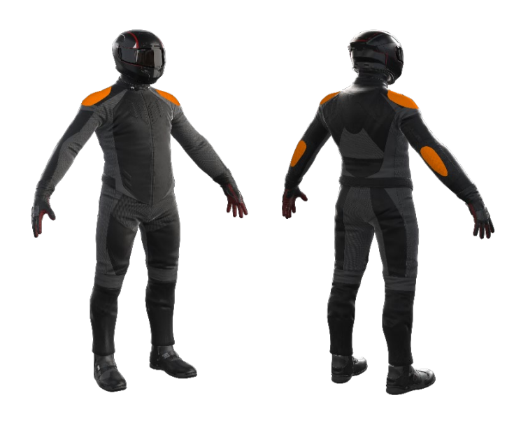
Impact Protection Performance Impact rating 4/10 Impact score 28.7

The jacket was tested for impact protection and coverage in accordance with MotoCAP test protocols. The diagram below is a visual indication of the likely performance of each impact protector calculated from the data in the table below. The colour coding is based on the worst performing score for average or maximium force for each impact zone. Areas shaded black are not considered for impact protection ratings.