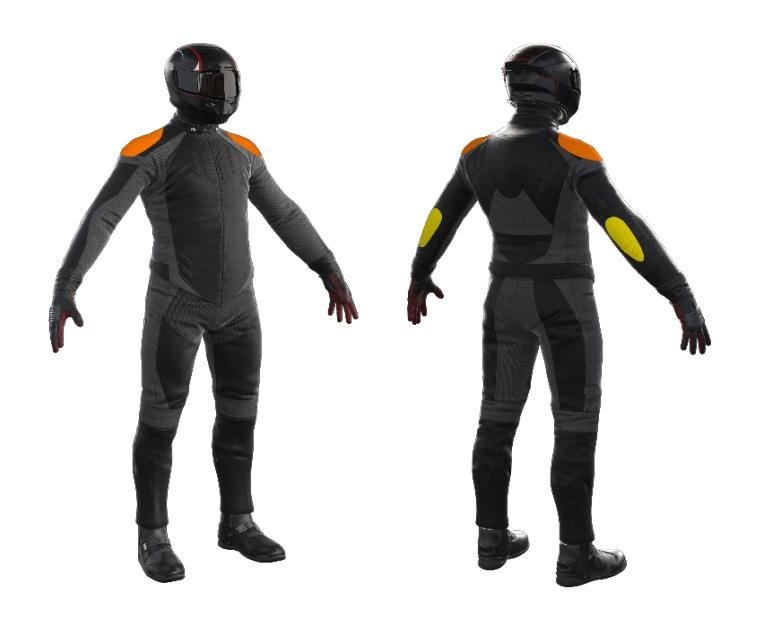
Impact Protection Performance Impact rating 4/10 Impact score 31.4

The jacket was tested for impact protection and coverage in accordance with MotoCAP test protocols. The diagram below is a visual indication of the likely performance of each impact protector calculated from the data in the table below. The colour coding is based on the worst performing score for average or maximium force for each impact zone. Areas shaded black are not considered for impact protection ratings.