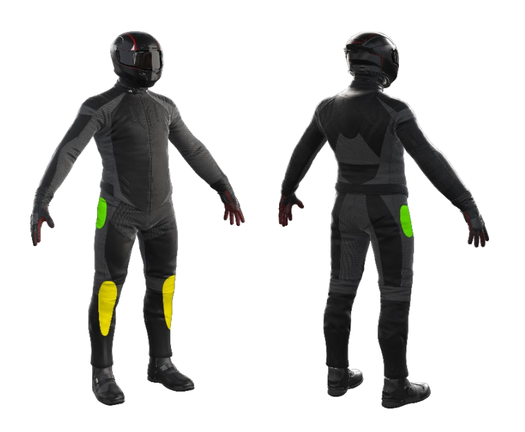
Impact Protection Performance Impact rating 9/10 Impact score 67.6

These pants were tested for impact protection and coverage in accordance with MotoCAP test protocols. The diagram below is a visual indication of the likely performance of each impact protector calculated from the data in the table below. The colour coding is based on the worst performing score for average or maximium force for each impact zone. Areas shaded black are not considered for impact protection ratings.