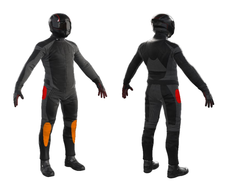
Impact Protection Performance Impact rating 1/10 Impact score 0.0

These pants were tested for impact protection and coverage in accordance with MotoCAP test protocols. The diagram below is a visual indication of the likely performance of each impact protector calculated from the data in the table below. The colour coding is based on the worst performing score for average or maximium force for each impact zone. Areas shaded black are not considered for impact protection ratings.