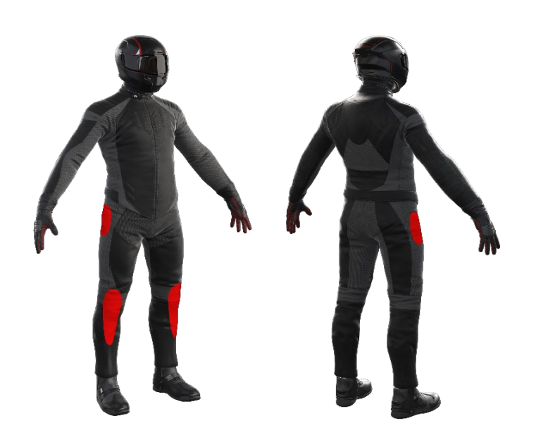
Impact Protection Performance Impact rating 3/10 Impact score 19.3

These pants were tested for impact protection and coverage in accordance with MotoCAP test protocols. The diagram below is a visual indication of the likely performance of each impact protector calculated from the data in the table below. The colour coding is based on the worst performing score for average or maximium force for each impact zone. Areas shaded black are not considered for impact protection ratings.