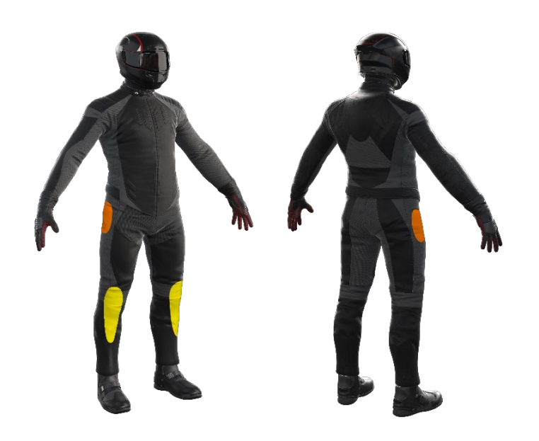
Impact Protection Performance Impact rating 6/10 Impact score 45.3

These pants were tested for impact protection and coverage in accordance with MotoCAP test protocols. The diagram below is a visual indication of the likely performance of each impact protector calculated from the data in the table below. The colour coding is based on the worst performing score for average or maximum force for each impact zone. Areas shaded black are not considered for impact protection ratings.