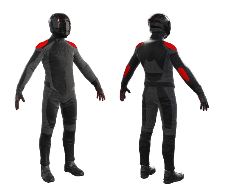
Impact Protection Performance Impact rating 1/10 Impact score 0.0

The jacket was tested for impact protection and coverage in accordance with MotoCAP test protocols. The diagram below is a visual indication of the likely performance of each impact protector calculated from the data in the table below. The colour coding is based on the worst performing score for average or maximum force for each impact zone. Areas shaded black are not considered for impact protection ratings.